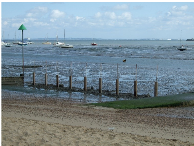
Paddling Pool 2 nd stage